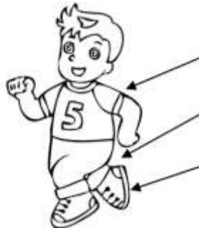
This is me!